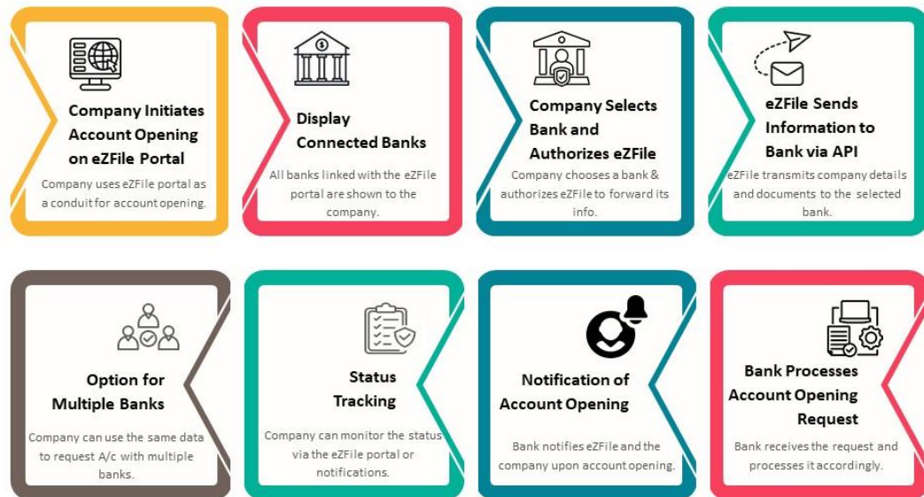
Illustration 2: Push Based Mechanism Process Flow

deactivate the account. This system would allow for swift account setup with limited transaction capabilities until all compliance requirements are fulfilled. Typically, such provisional accounts would have lower transaction limits or restricted service access until the verification process is complete. Moreover, for the purpose of auto-opening of corporate account, the RAAST platform which is generally connected with all banks, may also be leveraged for integration purposes, if deemed appropriate, to facilitate smoother and standardized transaction processing across all banks to streamline corporate account openings