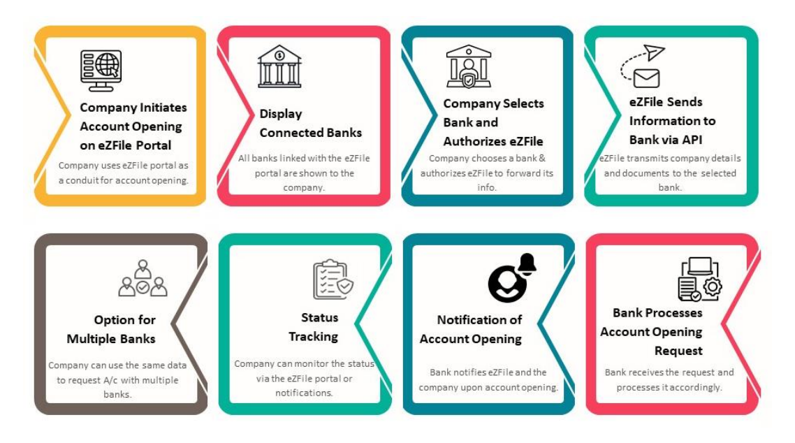
Illustration 2: Push Based Mechanism Process Flow

deactivate the account. This system would allow for swift account setup with limited transaction capabilities until all compliance requirements are fulfilled. Typically, such provisional accounts would have lower transaction limits or restricted service access until the verification process is complete. Moreover, for the purpose of auto-opening of corporate account, the RAAST platform which is generally connected with all banks, may also be leveraged for integration purposes, if deemed appropriate, to facilitate smoother and standardized transaction processing across all banks to streamline corporate account openings