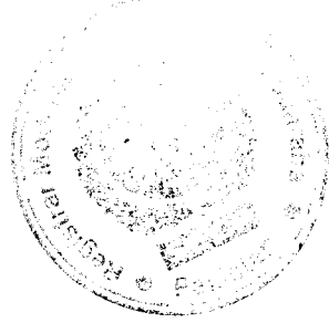
Bushra Aslam Registrar Modaraba